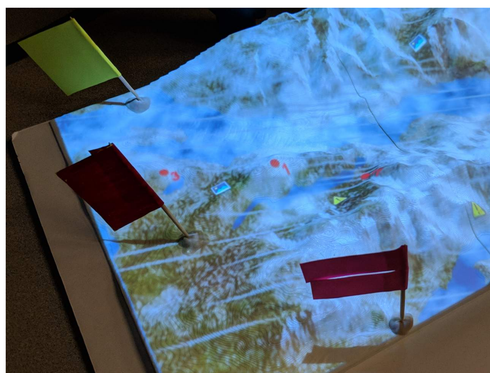
Representations of cloud cover and wind over the terrain.