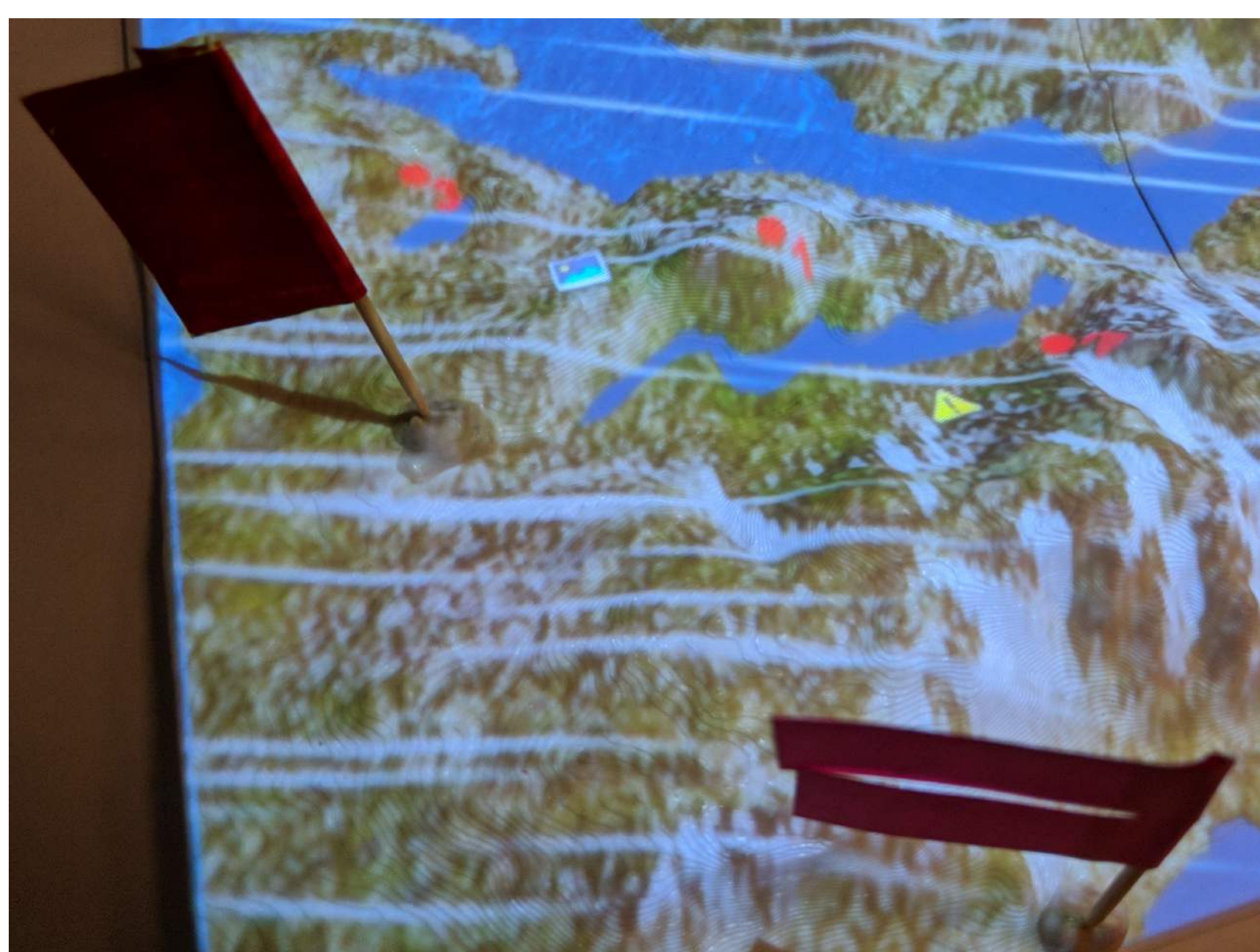
Lines move across the terrain to represent the speed and direction of wind.